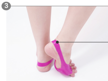
3 Fastening band