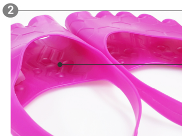
2 Acupressure bumps