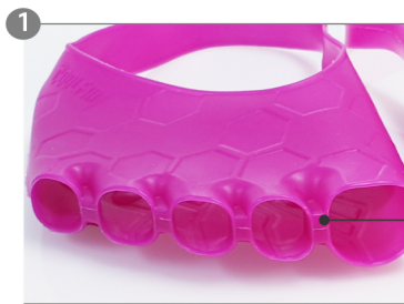
1 Spacers in between toes

Moving the feet and raising their temperature will turn the product into a brighter color.